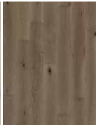
Santal rustic ◊