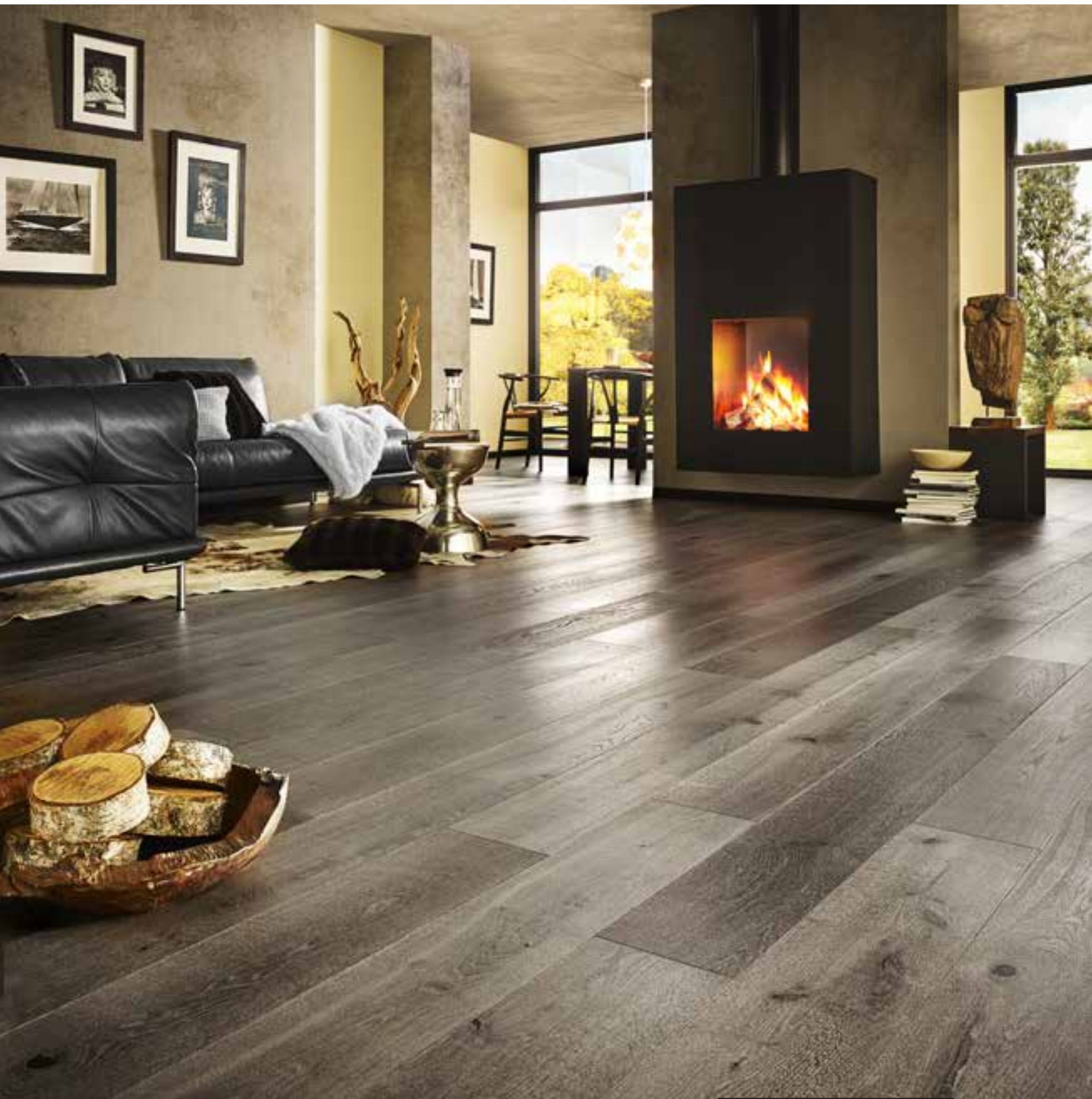
DESIGNER 19P - Pomerol Rustic