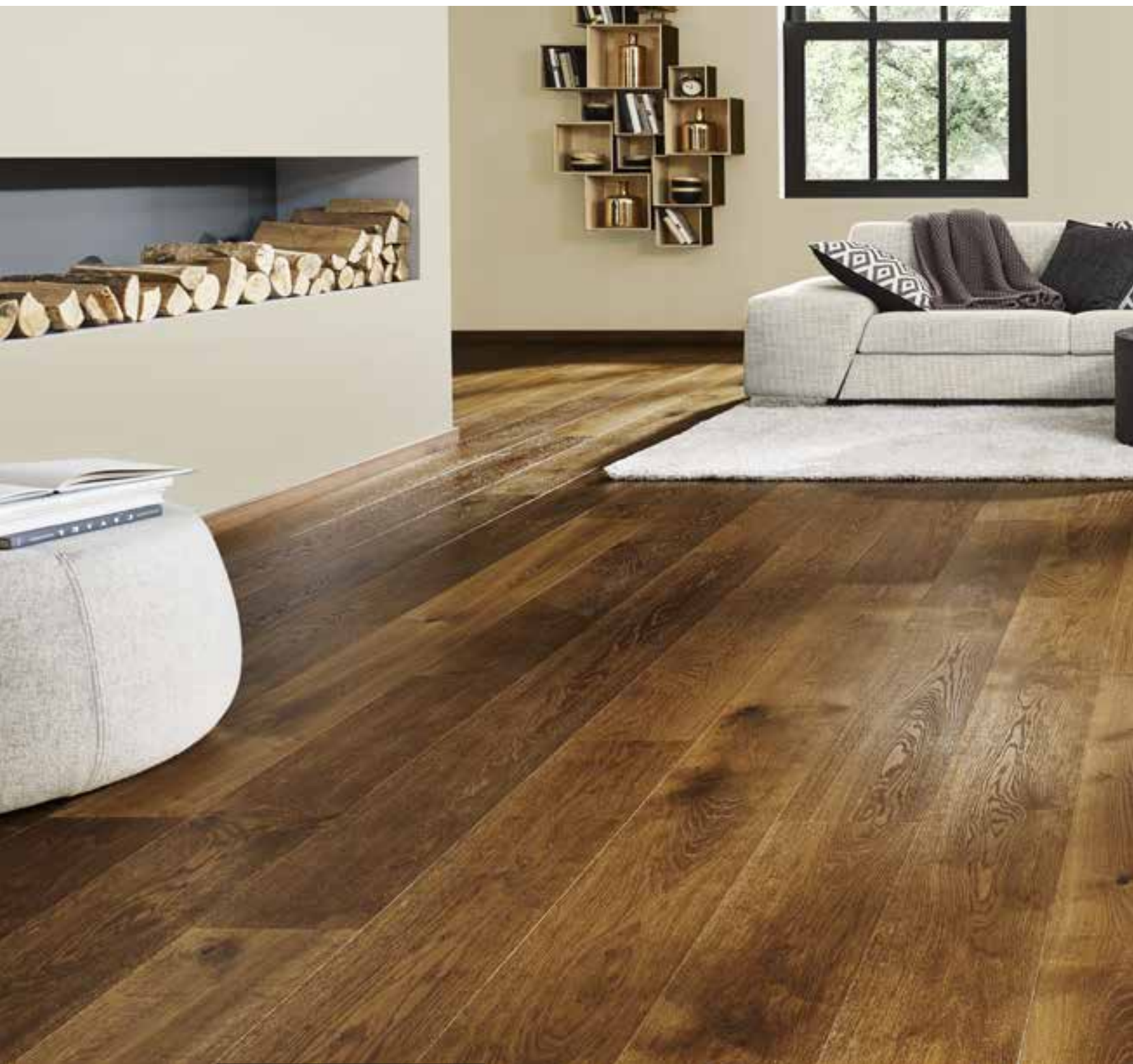
DESIGNER 14P - Colombard Rustic