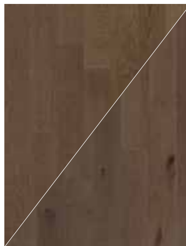
Antique select / rustic ✨