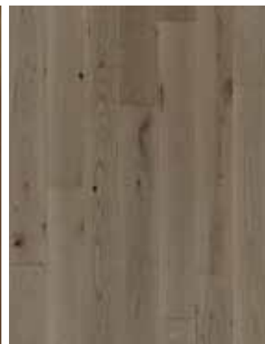
Lys rustic ◊