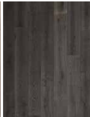
Bouchalès rustic ◊