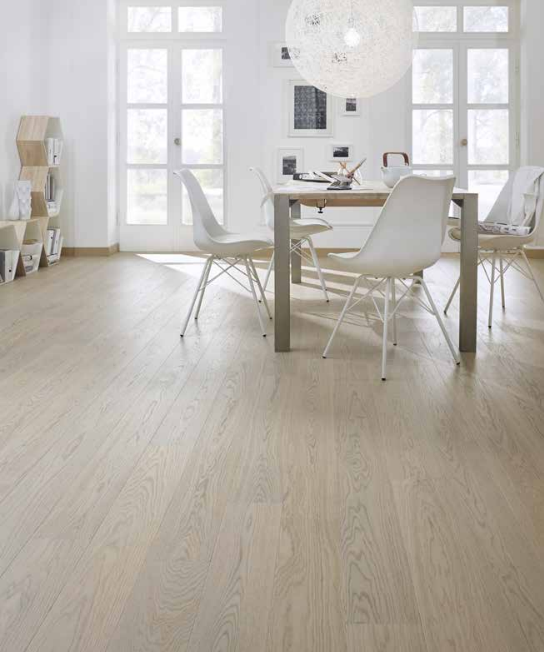
PREMIER 14H - Milk Select