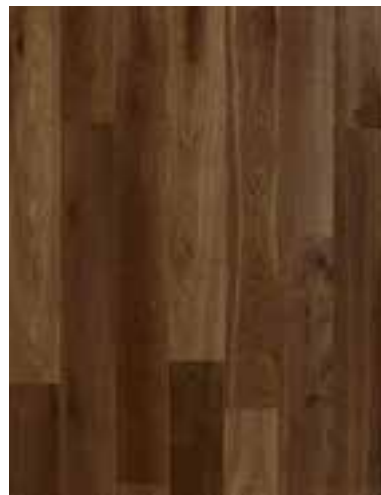
Colombard rustic ◊