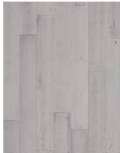
Sémillon rustic ∅