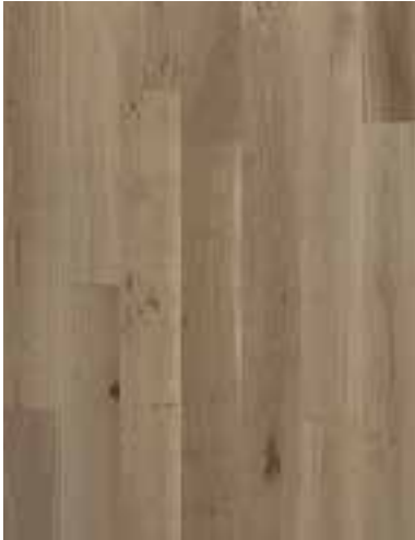
Diamond rustic ∅