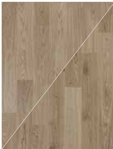
Ivory select / rustic ✨