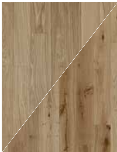
Natural select / rustic ∅

4 trendy timeless colours with OILED finish. Available in select and rustic