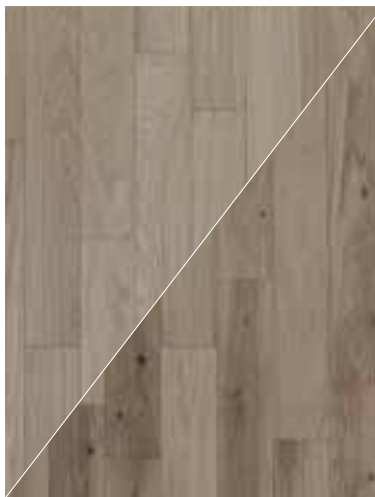
Pure select / rustic ∅