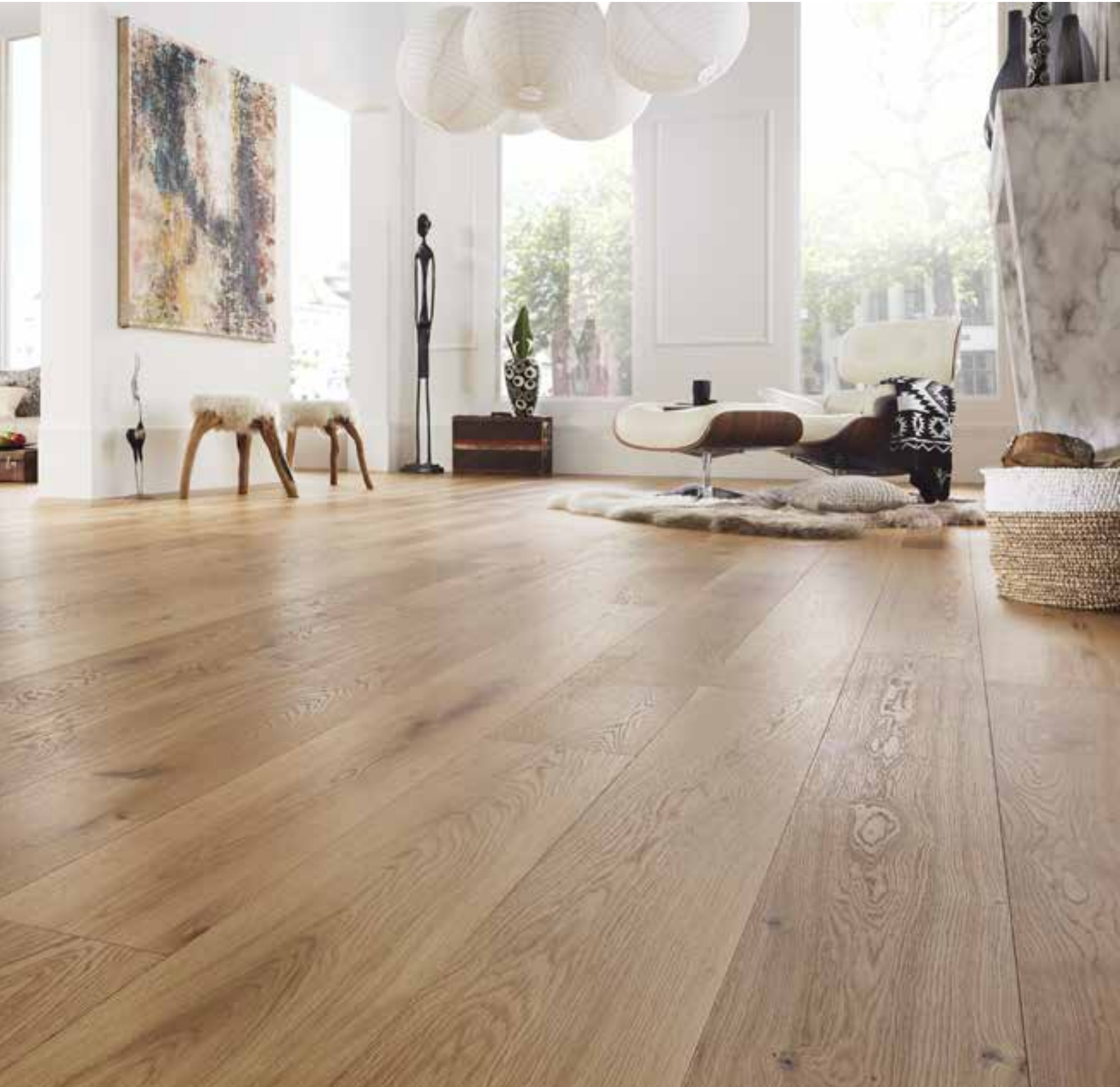
DESIGNER 19P - Natural Rustic