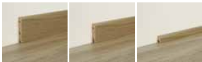
1 skirting, 3 heights

Skirting dimensions: 2150 x 80 x 14 mm (84.6" x 3.2" x 0.5")