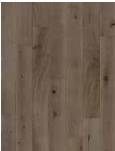
Elixir rustic ∅