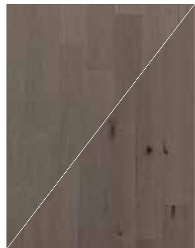
Manhattan select / rustic ✨