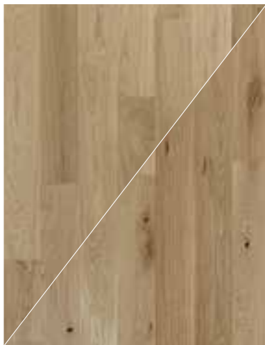
European select / rustic ✨

7 trendy, timeless colours with LACQUERED finish. Available in select and rustic