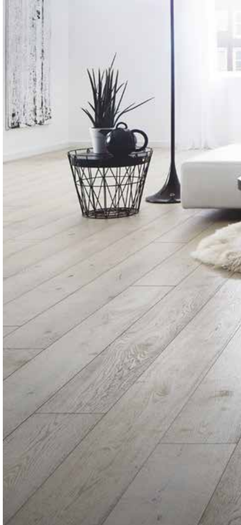
DESIGNER 19H - Sémillon Rustic

Cabbani parquet is perfect for use in combination with underfloor heating, as long as the floor temperature does not rise above 27°C (80°F). Because there are different underfloor heating systems, we recommend following the manufacturer's instructions. Ask our distributors for more information. Specific laying instructions can also be found on www.cabbani.com/en/downloads .