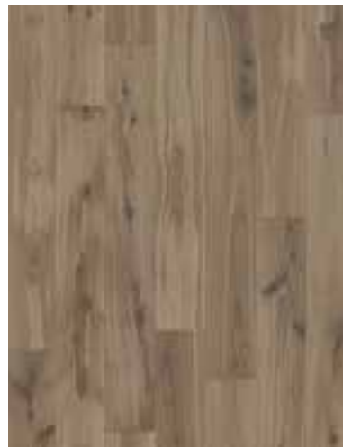
Boreal rustic ◊