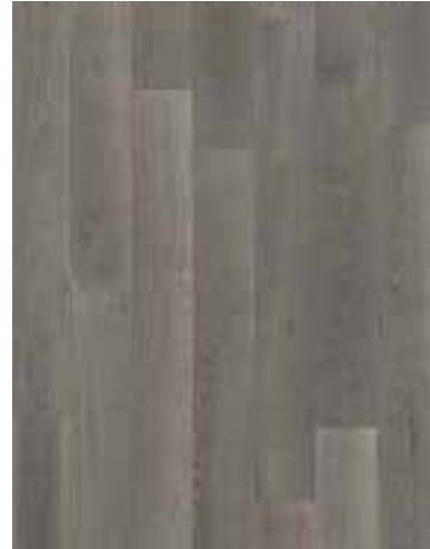
Graves rustic ∅