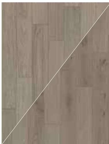
Desert select / rustic ✨