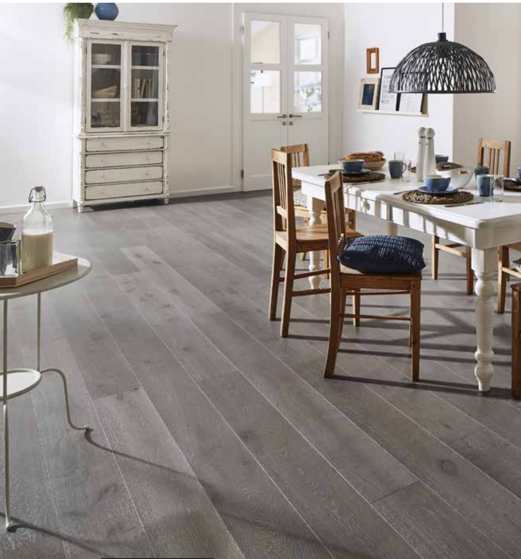
DESIGNER 14H - Graves Rustic