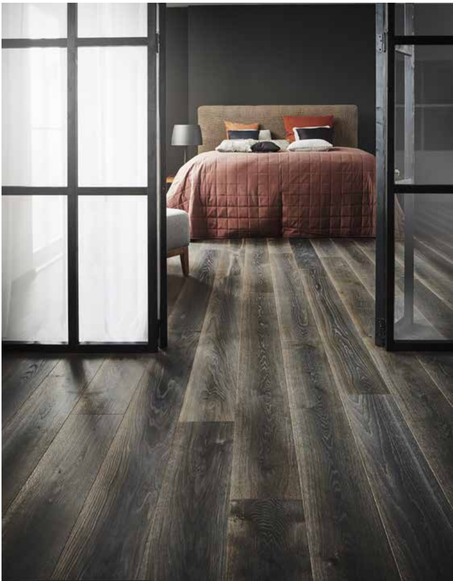
DESIGNER 19H - Bouchalès Rustic