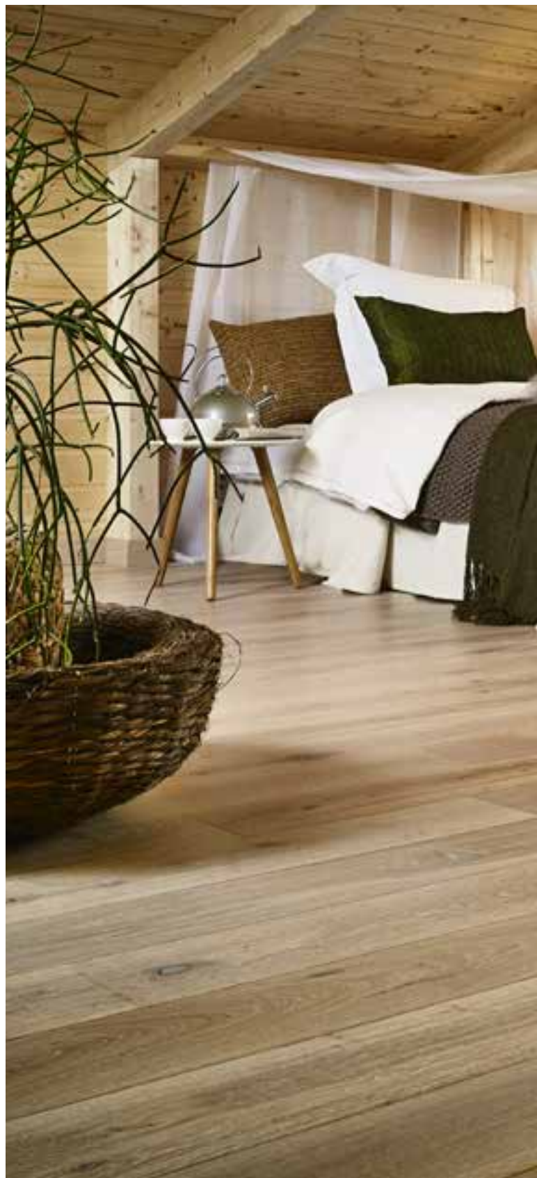
ELITE 14H - Boreal Rustic

We have all the necessary accessories to finish your Cabbani parquet perfectly. For instance, we have designed a very beautiful and convenient 3-in-1 skirting board for all designs from our range. The height of this veneer skirting board can be adjusted according to your taste or application. Furthermore, 3-in-1 profiles are also available (end, adjustment and transitional profiles) as well as matching stair tread nosing. More information is given on pages 47-48.