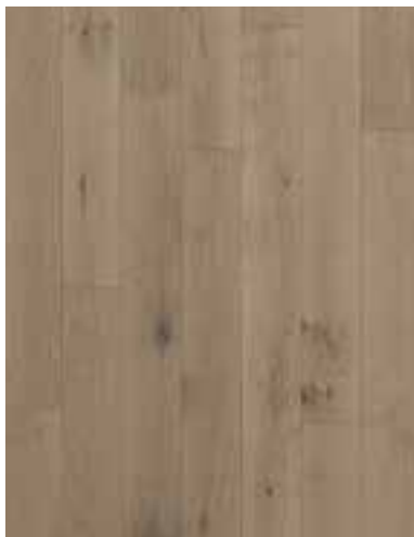
Stone rustic ✕