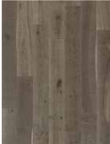
Pomerol rustic ∅