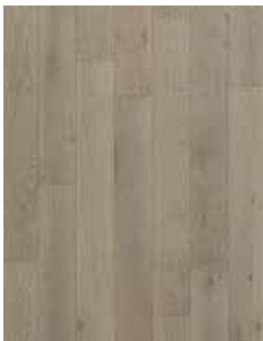
Alps rustic ✕