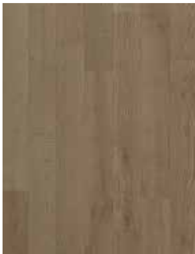
Himalaya rustic ✕