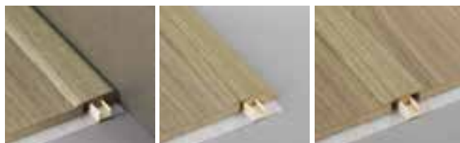
1 profile, 3 applications

Profile dimensions: 2150 x 47 x 11 mm (84.6" x 1.9" x 0.4")