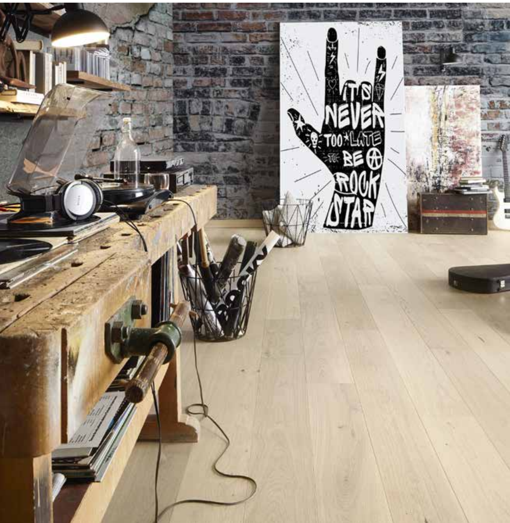
DESIGNER 10H - Pure Rustic