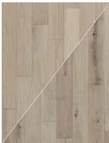
Polar select / rustic ∅