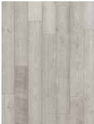
Leognan rustic ∅