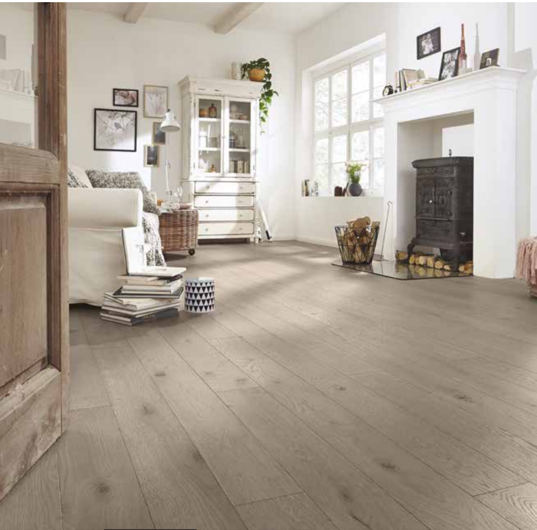
ELITE 14P - Santal Rustic