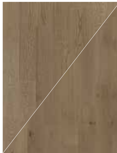
Umber select / rustic ✨