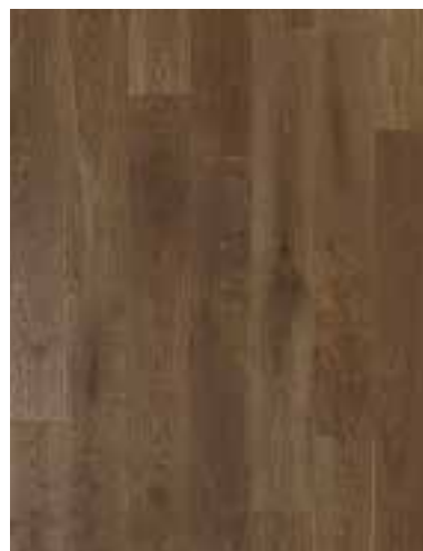
Tonka rustic ◊