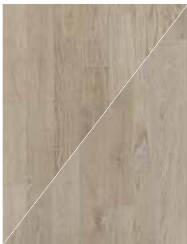
Milk select / rustic ✨

A varnish finish requires less maintenance and provides better long-term protection. The varnish layer completely seals the pores of the wood. Every Cabbani floor is provided with 8 coats of UV-cured water-based lacquer. This provides a low-maintenance floor and optimal protection against wear, scratching and stains.